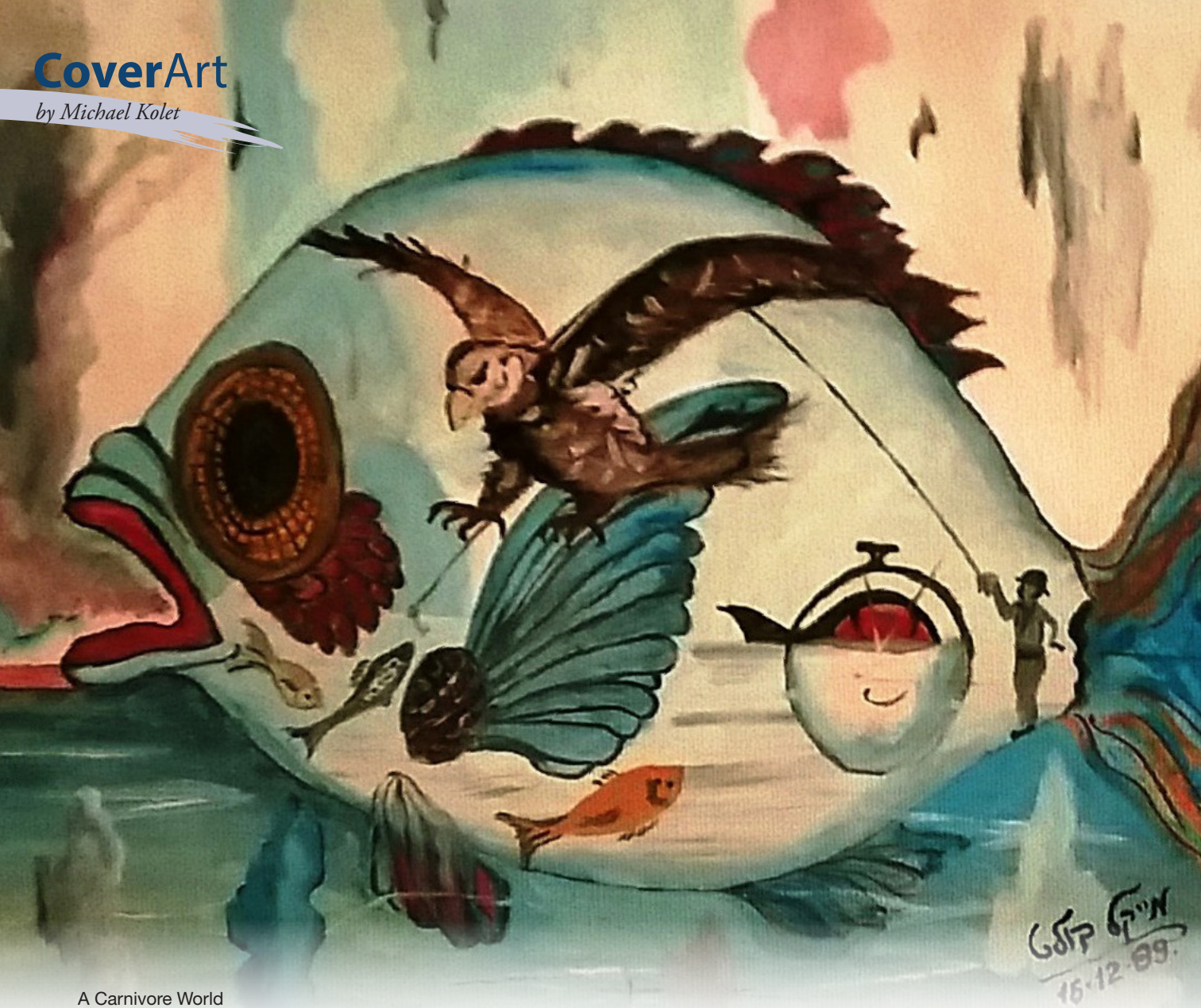
A Carnivore World